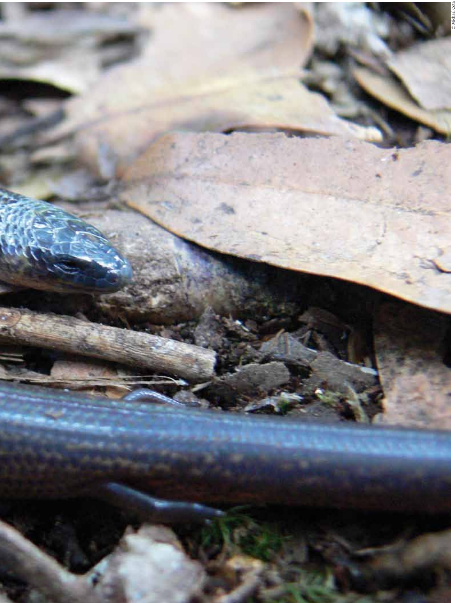
A further new species discovered in 2011 was the vibrant iridescent blue skink, Larutia nubisilvicola , from Thailand.