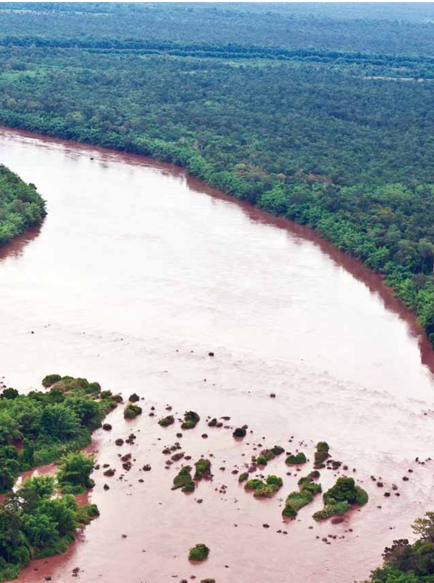
The mighty Mekong river flowing through flooded forest in Cambodia.