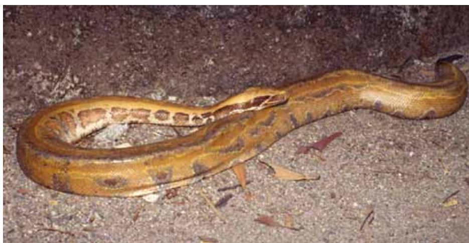
© George Zug, Division of Amphibians & Reptiles, National Museum of Natural History-Smithsonian

TWENTY-ONE NEW REPTILE SPECIES WERE DISCOVERED IN THE GREATER MEKONG IN 2011