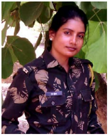
Prem Kawar Shaktavat Wild Life Sanctuary, Bhensrodgarh, India

In my childhood I was attracted to the mountains, valleys and forests, visible from my village. I used to be very curious about the mysteries lying in the forests. There were temptations to snoop into the kind of flora and fauna that forests hide in them.