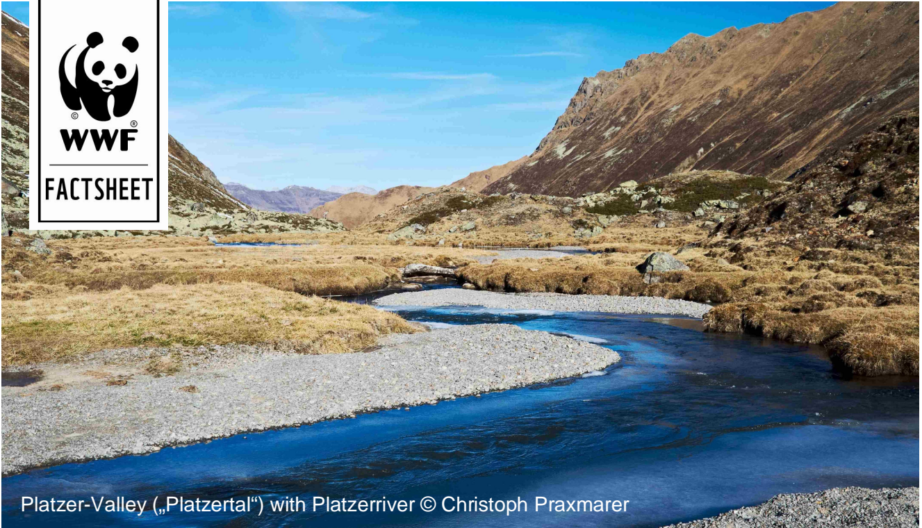
Platzer-Valley („Platzertal“) with Platzer river