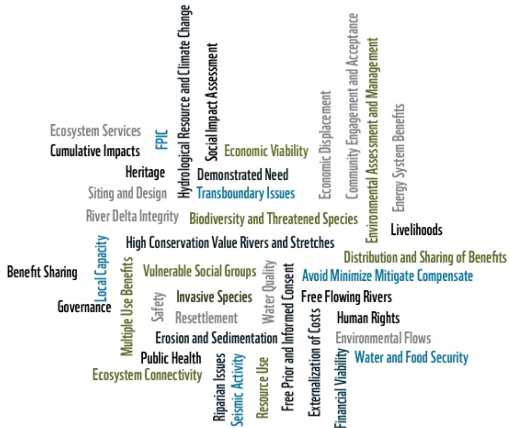
Figure 1. Sustainability aspects to consider in dam projects