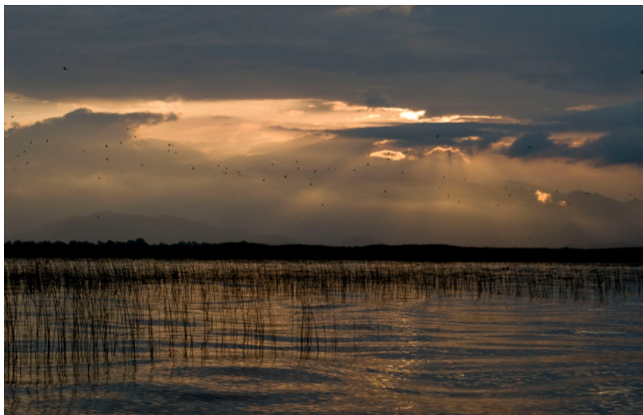
Lake Skadar National Park, Montenegro viewed from the Albanian border with cormorants in flight

A sustainable approach to water and energy planning is required to avoid further large-scale biodiversity loss and socio-economic impacts. The framework for decision-making outlined by the World Commission on Dams (WCD) in 2000 offers such an approach and is endorsed by WWF. Progressive parts of the hydropower community are promoting continuous improvement towards strong sustainability performance. Significant progress was made by the Hydropower Sustainability Assessment Forum, which over three years developed the Hydropower Sustainability Assessment Protocol ( www.hydrosustainability.org ), a broadly accepted tool to measure and improve sustainability performance of hydropower projects across a range of criteria, thus identifying its strengths and weaknesses. It is the Protocol's aim and of collective interest that developers, regulators, financiers, and other interested parties adhere to high sustainability standards.