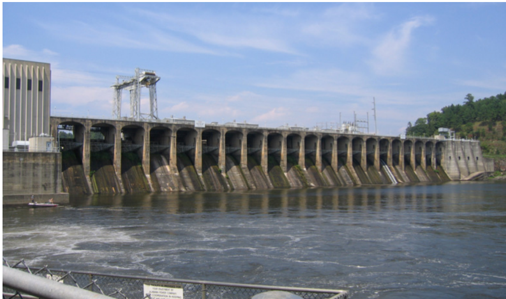
The Mitchell Dam, one of seven dams along the Coosa River

Once a river is dammed, not all is necessarily lost. Options exist for recovery and restoration of the ecosystem. Approaches can include dam removal at the end of its useful lifespan or adaptive management. Under US law, the Federal Energy Regulatory Commission (FERC) reconsiders dam licenses every 30 to 50 years, with the U.S. Fish and Wildlife Service (USFWS) responsible for conducting environmental reviews during the relicensing process.