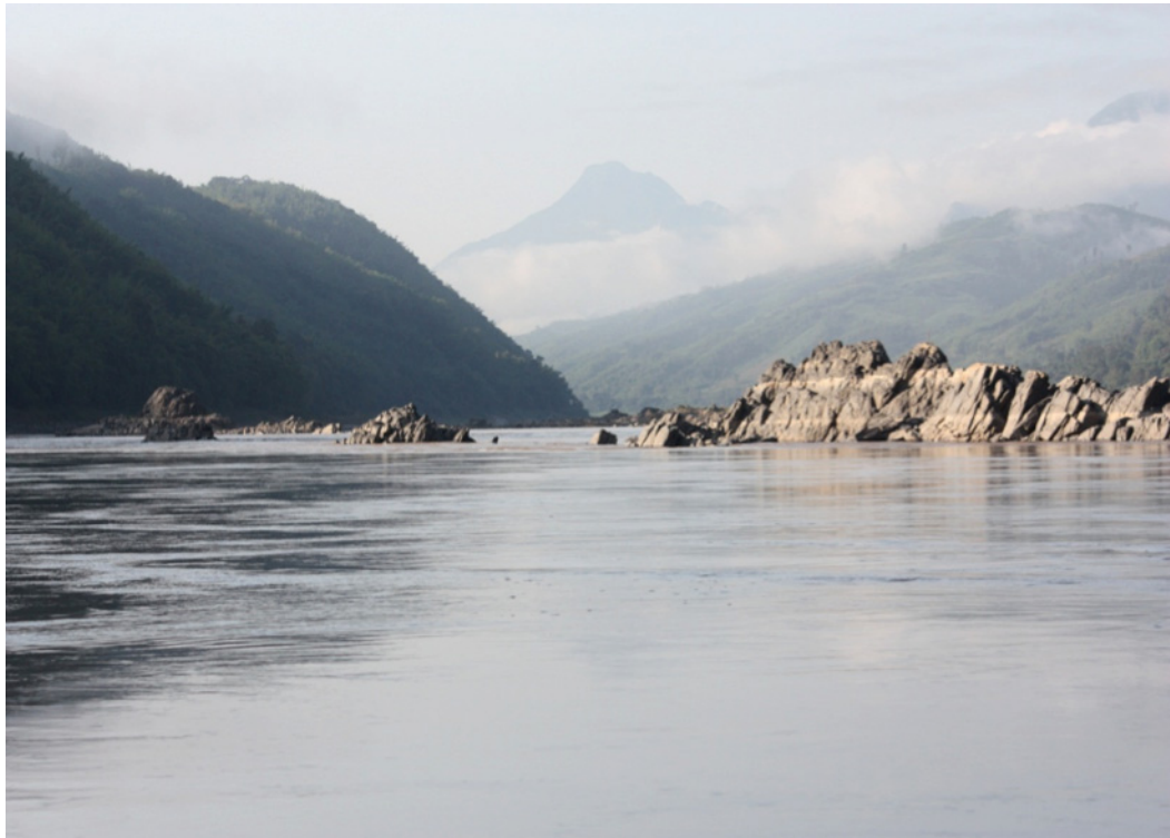
Mekong River

Seen from another perspective, even if past decision-making had been impartial and only based on honest estimates of costs and benefits at the time, past models were certainly imperfect. Increasingly good knowledge and tools are available today. Just as there is no good reason to use outdated technologies, there is no good reason to make decisions through outdated mechanisms.