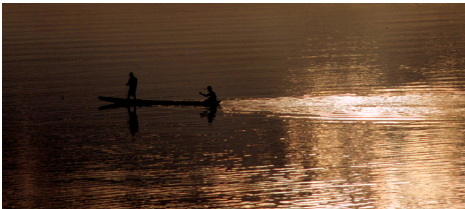
Fishing at sunset on the Mekong River, Vientiane, Laos

The 'seven sins' of dam development are unnecessary; ultimately it is better to avoid them if one is interested in longer-term outcomes and success. It is a matter of applying existing knowledge; good industry and regulatory practices are readily available. WWF calls on governments, banks, and the various industry sectors involved in dams - energy and water utilities, irrigation agencies, contractors, and others - to do their share to avoid the increasingly unacceptable conflicts over dams.