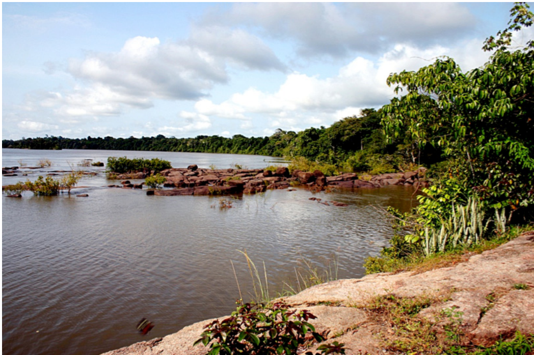
Xingu River, Brasil