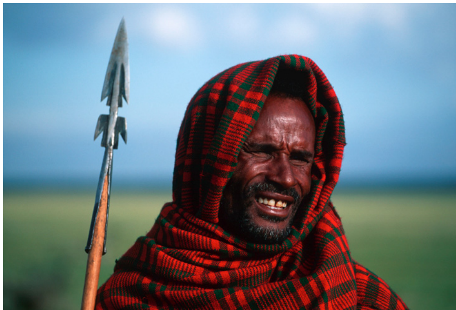
Man of the Oromo tribe, Ethiopia, with his fishing spear