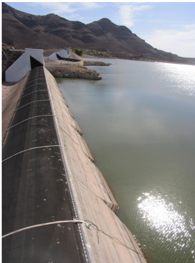
Irrigation Dam, Chihuahua State, Mexico