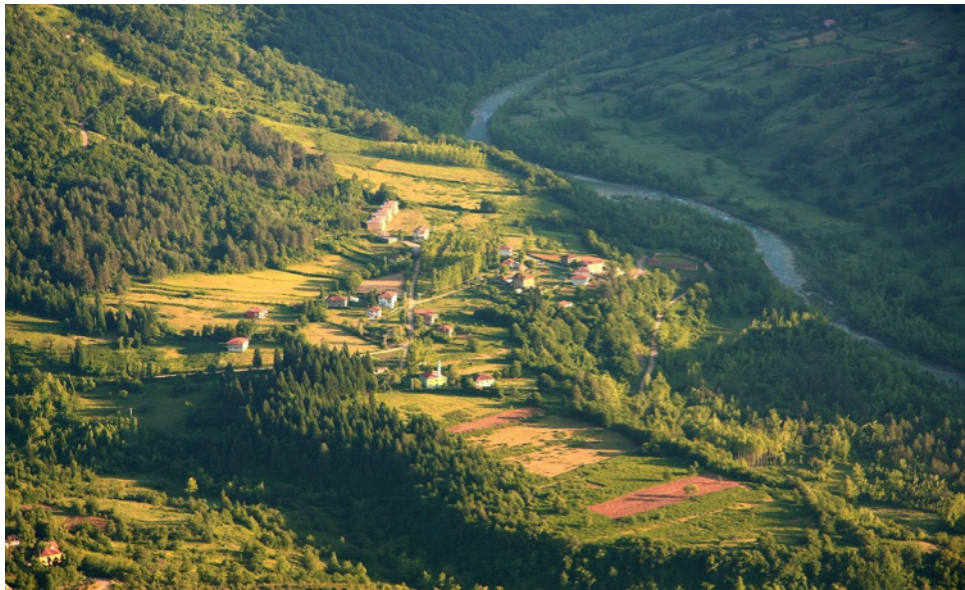
Area in Kure Mountains, Turkey where the Cide Regulator and Hydropower Plant is planned to be built