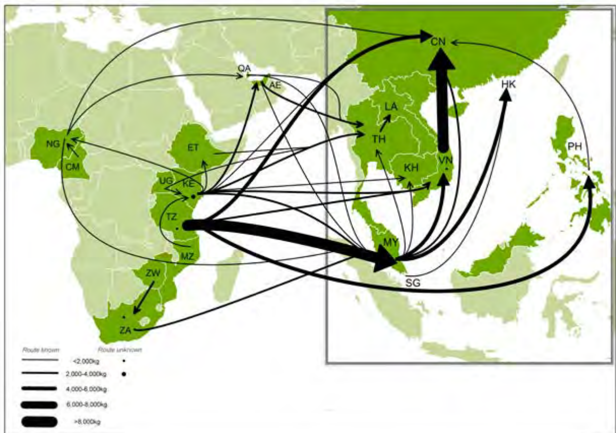
FIGURE 1 Trade routes for large-scale (>500 kg) seizures of ivory, 2009 - 2011 (ETIS, 03 November 2013).

In 2011, poaching levels, estimated from elephant carcasses, were the highest in a decade, while in the same year a record quantity of ivory was seized worldwide: 50.7 tonnes. It is believed that illegal trade in ivory has trebled since 1968 and more than doubled since 2010.